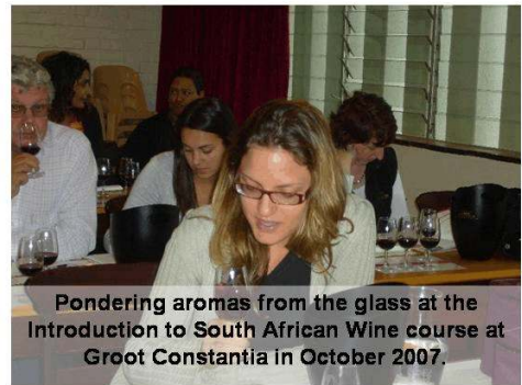
Pondering aromas from the glass at the Introduction to South African Wine course at Groot Constantia in October 2007.