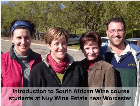
Introduction to South African Wine course students at Nuy Wine Estate near Worcester.

Here are a few memories from the last year at CWA - we hope to see you all in 2008 again, be it at our courses or at a wine show, showing off your tasting skills!