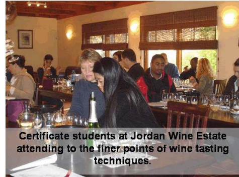
Certificate students at Jordan Wine Estate attending to the finer points of wine tasting techniques.