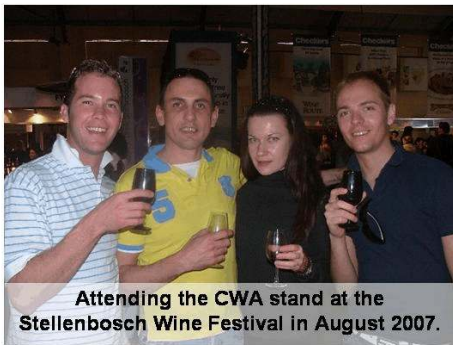
Attending the CWA stand at the Stellenbosch Wine Festival in August 2007.